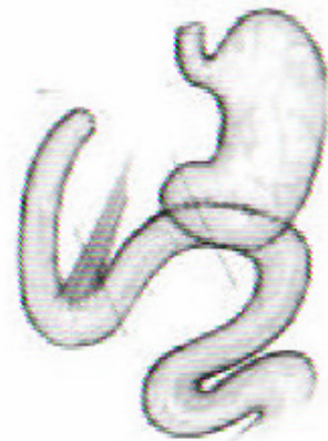
Standard Billroth II Gastrojejunostomy.

The Billroth II is the most commonly performed type of connection between the stomach and the small bowel. The Billroth II is a surgical procedure used routinely in the treatment of trauma, stomach cancer and peptic ulcers. In the usual Billroth II, the esophagus and the body of the stomach are distant from the Billroth II connection. The Billroth II connects the stomach to the jejunum, the upper-middle portion of the small intestine. Like the Mini-Gastric Bypass, the standard Billroth II places the connection between the stomach and the small bowel low on the stomach at the junction between the body and the antrum of the stomach. The lower part of the stomach is often removed in the usual Billroth II surgery.