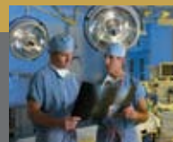
PIEDMONT JOINT REPLACEMENT CENTER