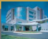
CAROLINA REGIONAL HEART CENTER